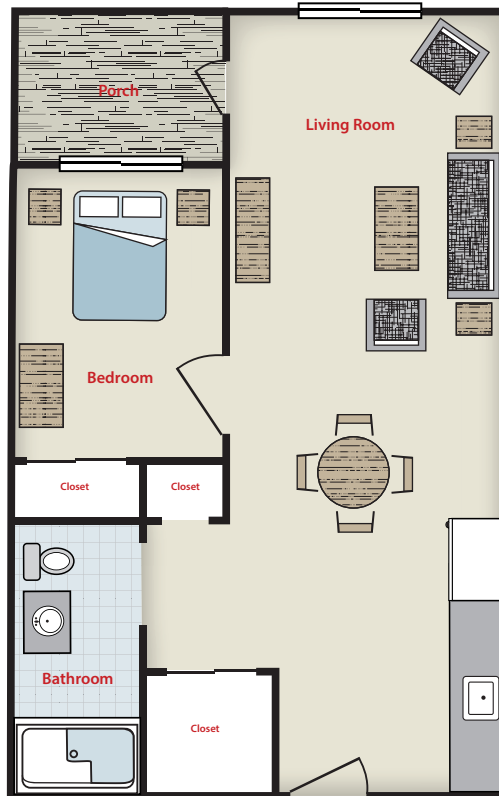
Charleston House One Bedroom (580 Sq. ft.)