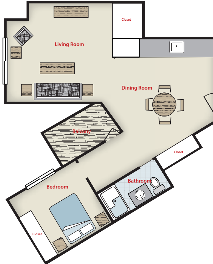
Charleston House One Bedroom Deluxe (680 Sq. ft.)